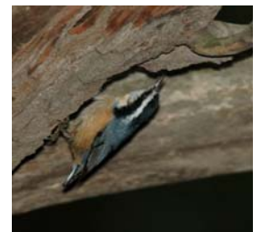
Red breasted nuthatch

Take a look at our new webpage. Completely redone, easier to use and lots of good information and links. www.waxwingassociates