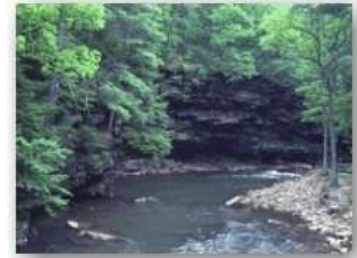
Trough Creek State Park Copperas Rock

Trees also indicate the coming of spring. Look for red maple trees as their twigs begin to turn red and red flower buds turn into red fuzzy flowers. Another early indicator is the weeping willow tree as its long flowing twigs begin to turn a mellow yellow, then bright yellow as the days continue to warm. Spring is just around the corner!