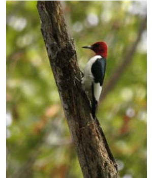
Red headed woodpecker

Canoe Creek has a variety of wetlands and old fields that provide excellent habitat for woodcock nesting. Observe this unique ritual as the male tries to find a mate as the light of day fades to night time. Leader: Dr. Stan Kotala 946-8840 Meet Canoe Creek State Park Pavilion 1, 6:30 PM