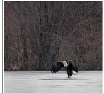
Bald Eagle on ice