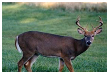
Pennsylvania White tail Deer

Wildlife agencies suggest feeding only birds. Birdfeeders require animals to have very limited contact with humans so the danger of becoming habituated to human presence is minimized. Please keep the bird feeders clean to avoid unhealthy conditions and the spread of disease among birds,