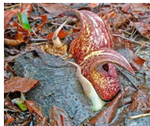
Skunk Cabbage Flower

To subscribe to Waxwing Newsletter send your email or mailing address to 140 Queen Ann Drive Hollidaysburg, PA. 16648